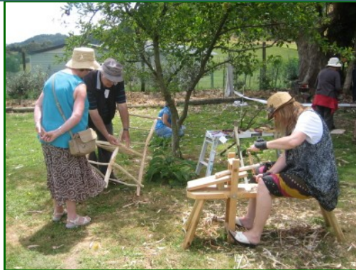
Bodging in our home orchard

There were over a thousand people here over the week long festival including lots of children.