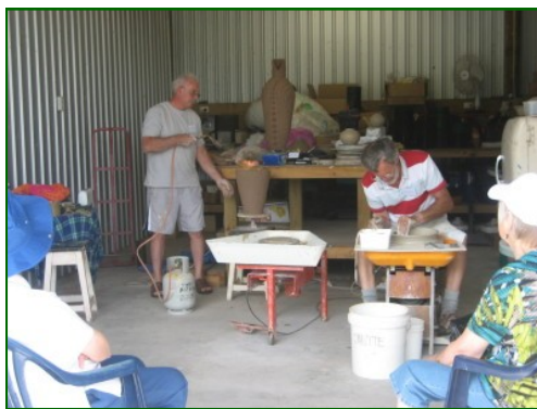
Potting in our potting shed!

It was lovely to see many families spending several hours here having a go at potting on the wheel, watching the demonstrations of oamaru stone carving, blacksmithing and bodging.