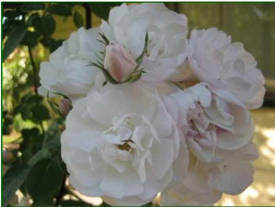
Double flowers of Dundee Rambler

I have had a customer asking me for a rose called Dundee Rambler for the last 3 years. Finally we had success with the cuttings and I have a good stock of Dundee Rambler. Naturally she was the first to get a box full despatched.