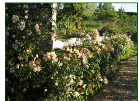
Our The Active Hedge