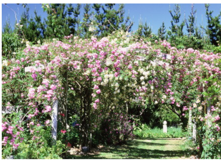
Rev John Gare Butler rambler dripping in roses!

We look forward to meeting you. Have a great gardening year and to help here's a gift from us—see voucher above!