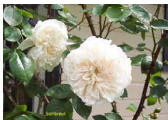
Sombreuil climbing tea

tensively planted. Another area is being turned into a potager garden surrounded by established buxus hedges. Did you know that standard roses traditionally symbolise the monks tending the monastery gardens—so of course they will have to feature here at Trinity. We have also planted a new white and silver themed garden featuring Karen's favourite rose a climbing tea—Sombreuil.