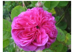
Duc de Cambridge

sonal favourites are Sombreuil, Duc de Cambridge, Archiduc Joseph, Therese Bugnet, Rugelda, R Roxburghi, Buff Beauty, Duchess de Brabant and Paul Transon, most of which are pictured in this newsletter. Of course the list of favourites is growing all the time!