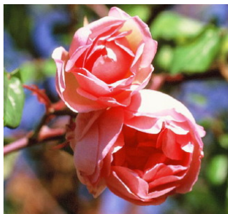
Duchess de Brabant

For example Duchess de Brabant, a climbing tea rose with fabulous cupped cabbagey, pink, fragrant