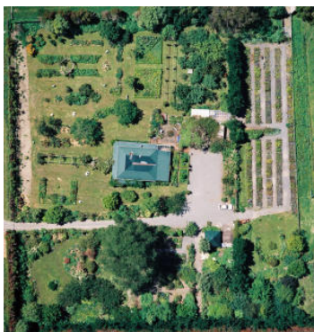
Trinity Farm aerial view

Having been here a year, we are now starting to put